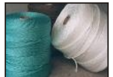
FIBRES, TAPES & ROPES