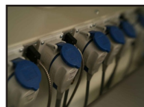
QUICK & EASY OPERATOR MAINTENANCE