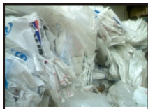
BAGS, SACKS & PUNCH-OUTS