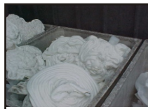
PURGINGS & START-UP SCRAP