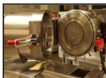
EASY CLEAN PELLETISING