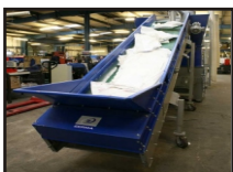
MATERIAL HANDLING OPTIONS