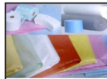
FABRICS & NON WOVENS