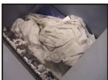
POWERFUL INTEGRATED SHREDDER