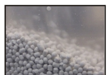
1ST GRADE QUALITY PELLETS